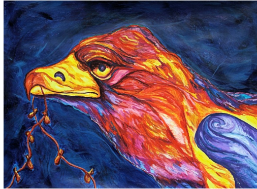
Spirit Messenger—This is of a Golden Eagle I helped take care of and I was asked to do a portrait of.