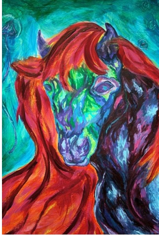
Sweet Medicine—Portrait of a friend's horse.